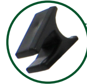
Inserts for fitting 1/2" poles